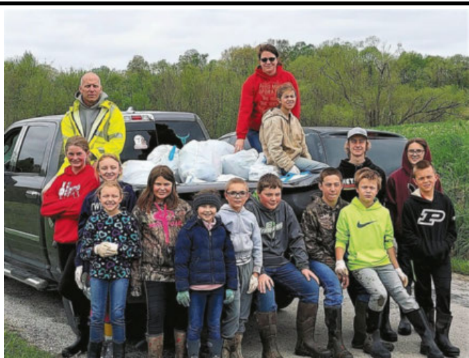
Annual Roadside Cleanup by the Salt Creek Jr Farmers! A great group of 4H kids! Thank you, guys, for your hard work!