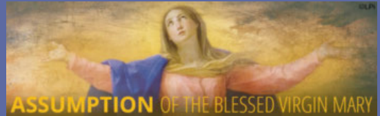
ASSUMPTION OF THE BLESSED VIRGIN MARY

Mon. Aug. 15th - Since it falls on a Monday this year, it is not a holy day of obligation.